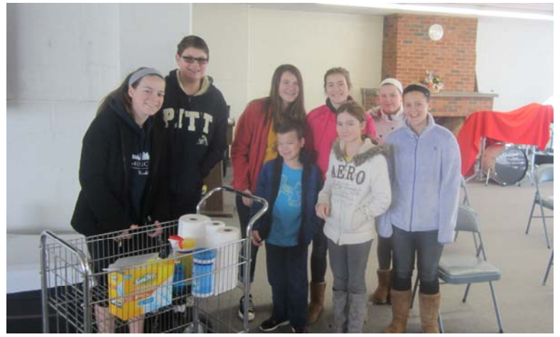
GIRL SCOUT TROOP 7090 (and family/friends)