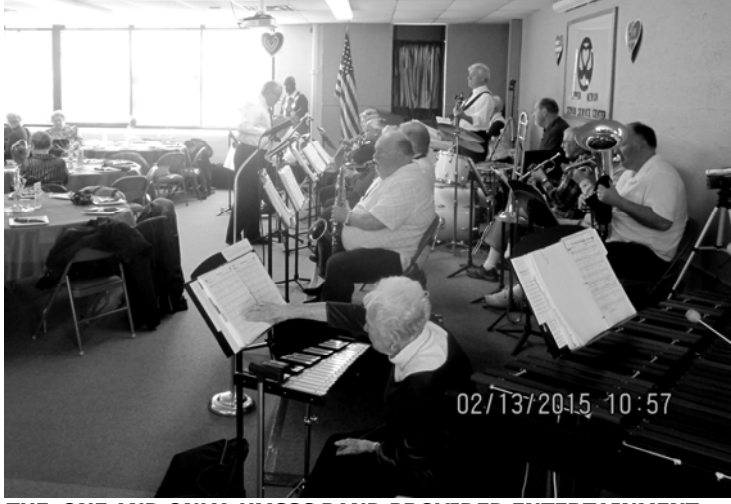
THE ONE AND ONLY UMSSC BAND PROVIDED ENTERTAINMENT