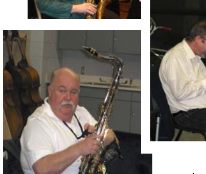
January 2012 – Page 6