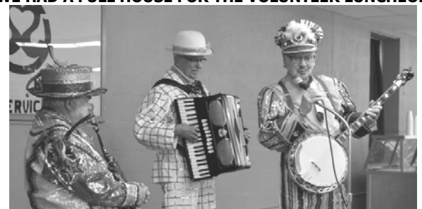
THE "HARDLY ABLES" PLAY A FEW FAVORITES