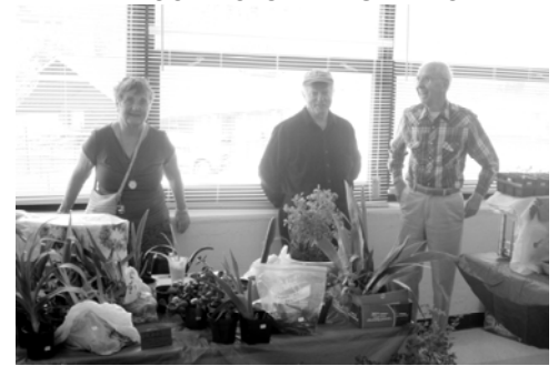
UMSSC GARDEN CLUB MEMBERS SELL THEIR PLANTS