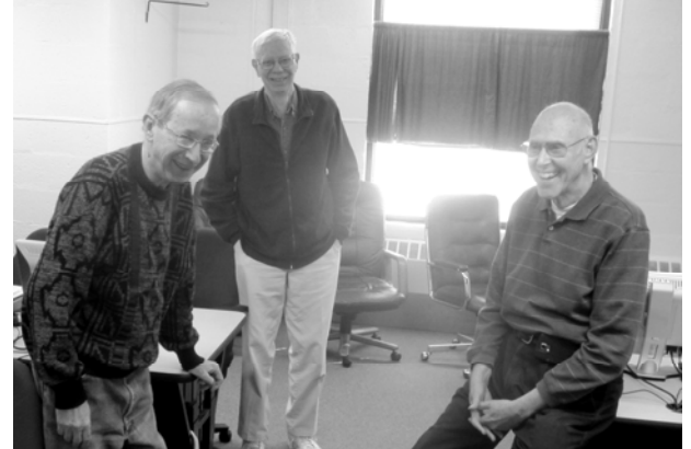
COMPUTER ROOM VOLUNTEERS