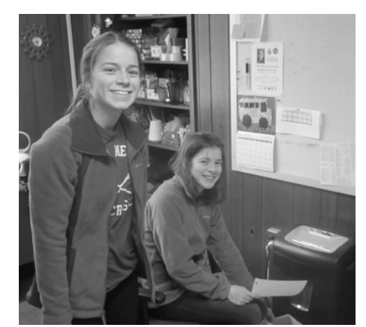
MORE GIRL SCOUTS . . .