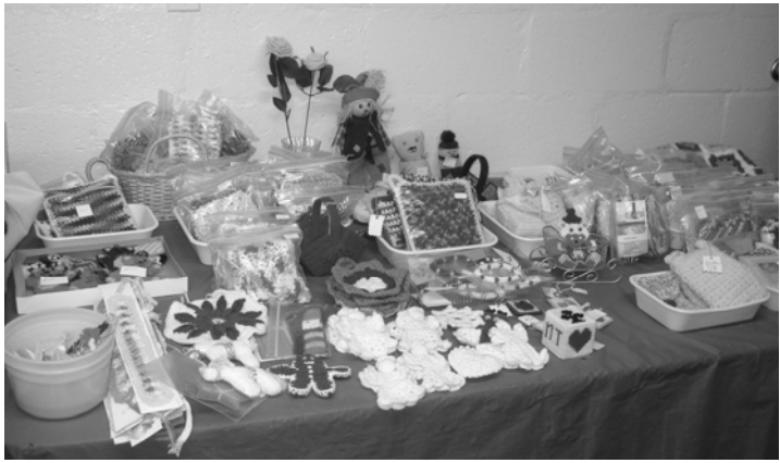
HAND-MADE CRAFTS FOR SALE IN OUR CRAFT ROOM