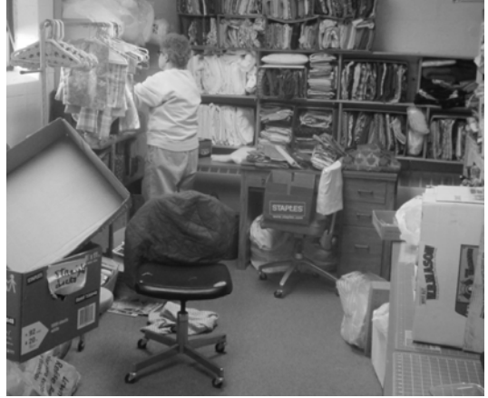
VOLUNTEER ORGANIZING SEWING ROOM