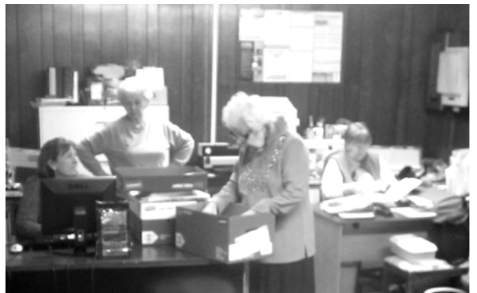
VOLUNTEERS WORKING HARD IN THE STAFF OFFICE