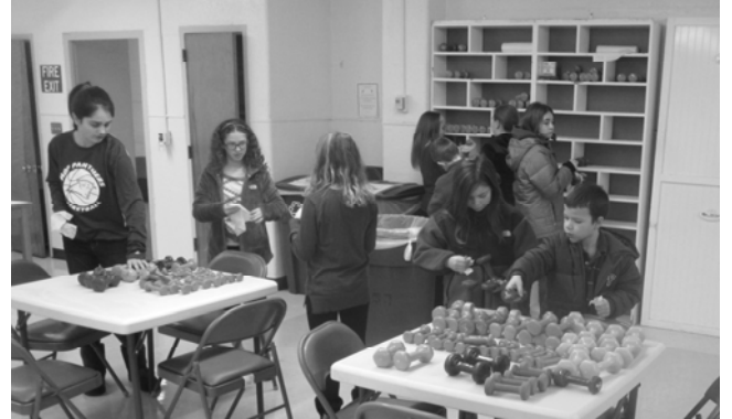
AND STILL MORE GIRL SCOUTS.